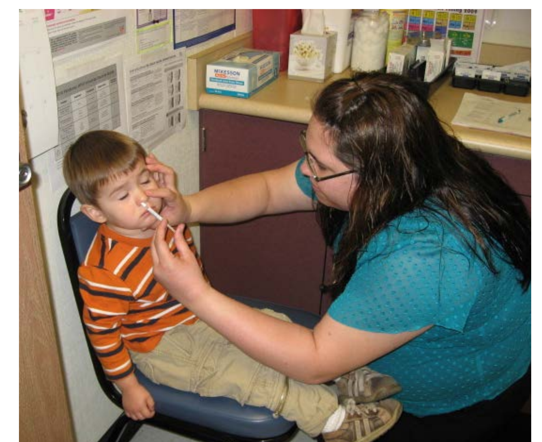
School nurse administering medication to child with asthma

We partnered with San Jose Unified School District (SJUSD) and School Health Clinics of Santa Clara County (SHCSCC) to evaluate the Nurse Demonstration project.