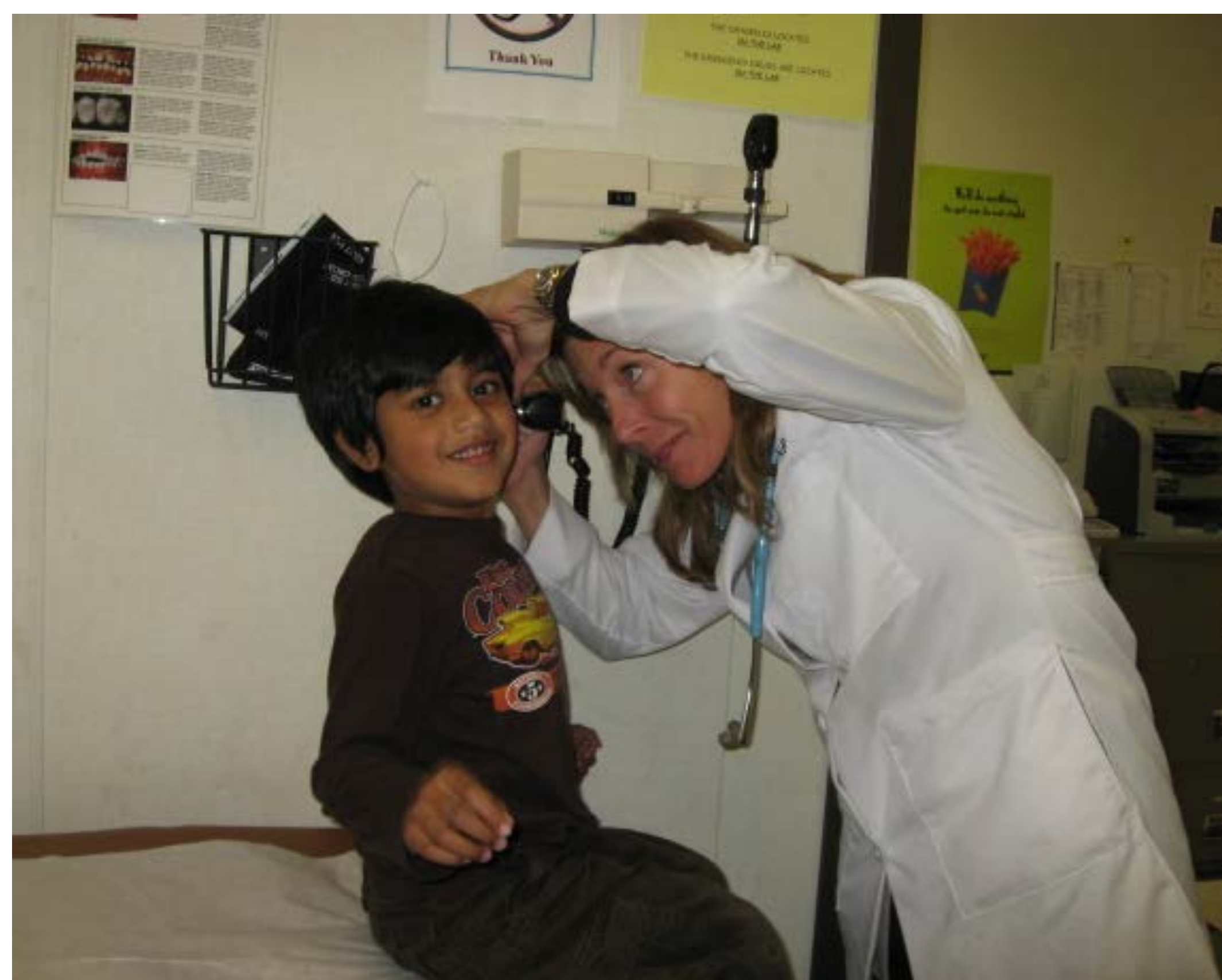
School nurse examining a child

According to the Centers for Disease Control (CDC), rates of chronic health conditions among school-age children have almost doubled from 12.8% to 26.6% in the past two decades, with obesity (17%), asthma (9.5%), behavioral problems (13-20%) being the most prevalent. This has adverse effects not only on the children's long term health, but also on their academic performance and school attendance. While school nurses could facilitate positive health outcomes for children, the state of California with a ratio of 1 nurse for every 2,200 students has one of the lowest nurse to student ratios in the nation.